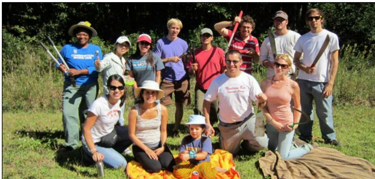
MDP and TCD students show the tools of trail maintenance on a service trip to Lake Butler park.