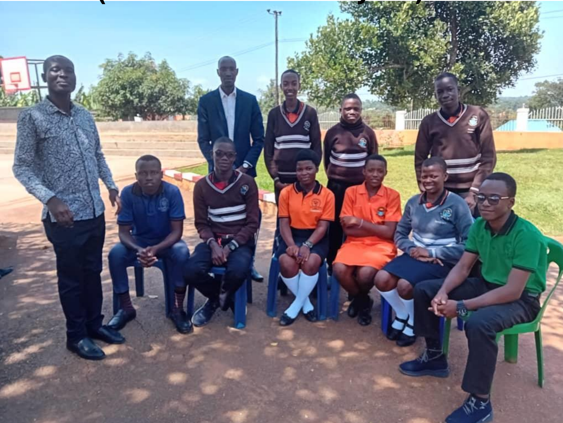
Current JSS Agriculture Club (As of 2024 school year).